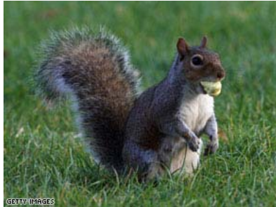
Some scientists fear a mysterious shortage of acorns this fall in the eastern U.S. will affect squirrels.

(CNN) -- Up and down the East Coast, residents and naturalists alike have been scratching their heads this autumn over a simple question: Where are all the acorns?